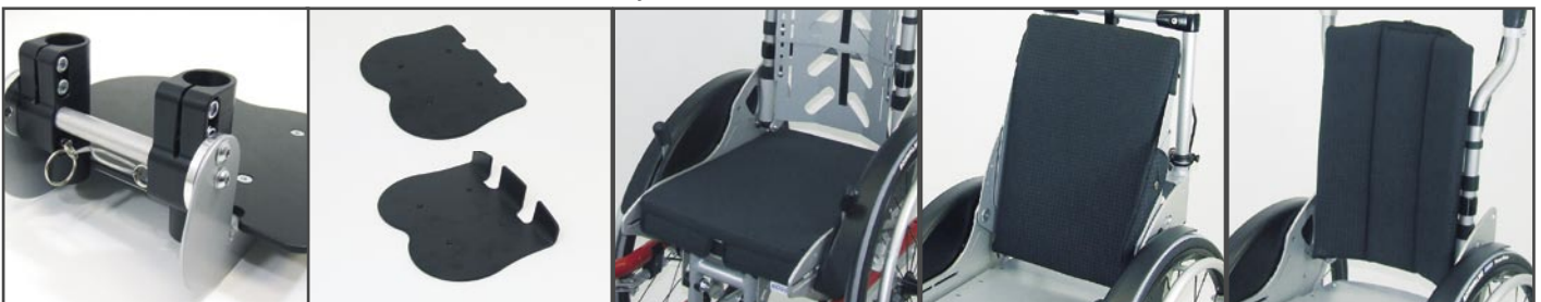
Foot rest bracket with flip up lock