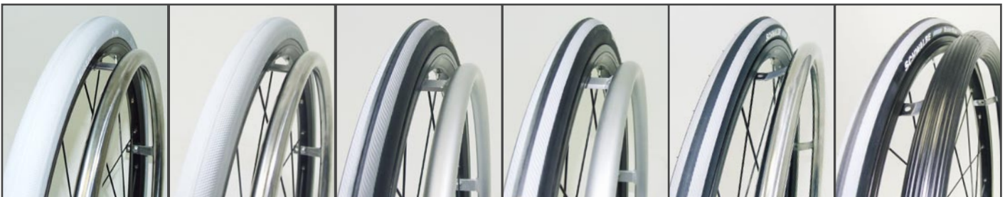
Rear wheel with PU-tires 20", 22", 24"