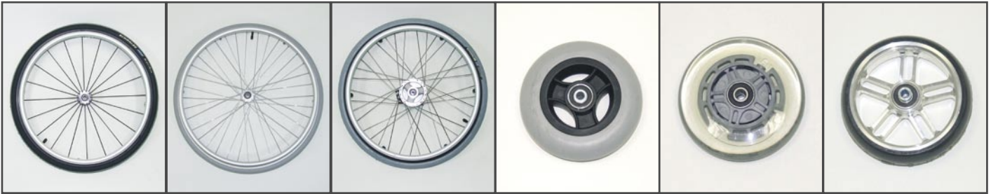
Rear wheel HOGGI light with pneumatic tires 20", 22", 24"