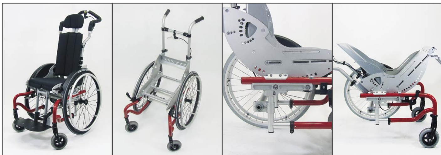
SWINGBO Plus with accessories