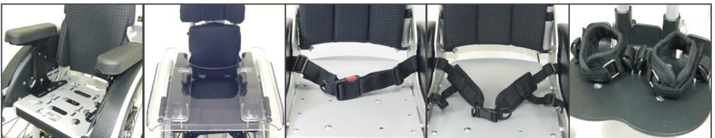
Armrests with PU pads