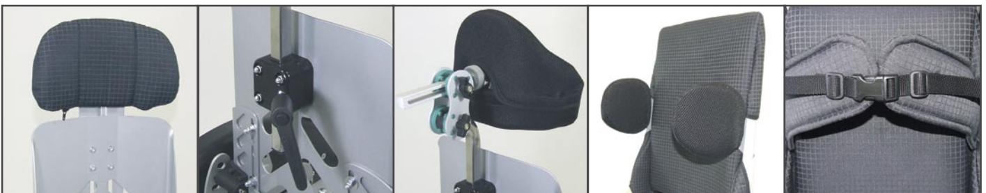
Headrest standard: With cushion