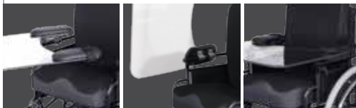
Swing Away Mount